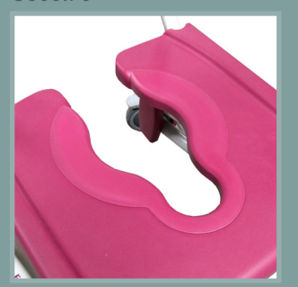
Adaptive seat plug.