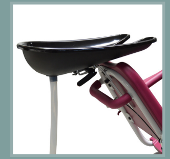
Hair wash basin.