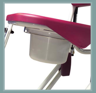
Commode pan option with guide rail.