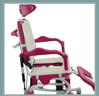
Seat and back cushion.