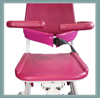
Set of 2 waterproof protections for abdominal sling.