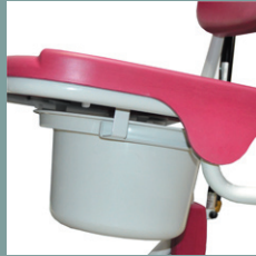
Commode pan option