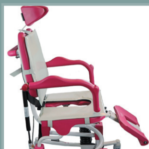
Seat and back cushion.