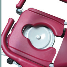
Moulded aperture seat