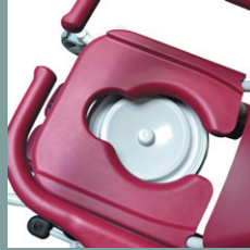
Moulded aperture seat