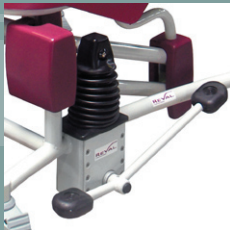
Hi/Lo hydraulic pedal