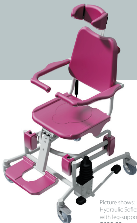
Picture shows: Hydraulic Soflex 5601.00 with leg-support Option 5600.50

The "Soflex" is a high adjustable tilt-in-space shower and toileting commode designed to provide, added comfort and posture management during bathing and toileting procedures.