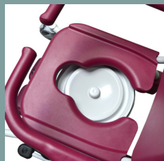
Moulded aperture seat