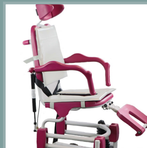
Seat and back cushion.