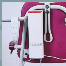
Waterproof electric control