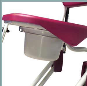
Commode pan option with guide rail.