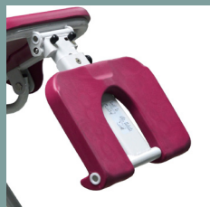
Foot-rest / leg-support