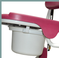
Ref. 5600.10 Pan option