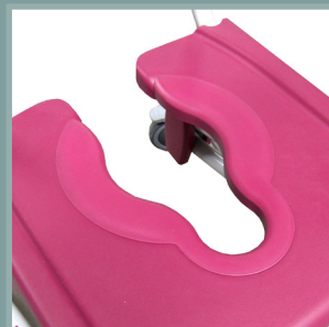
Adaptive seat plug.