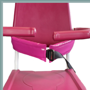
Set of 2 waterproof protections for abdominal sling.