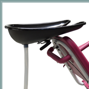
Hair wash basin.