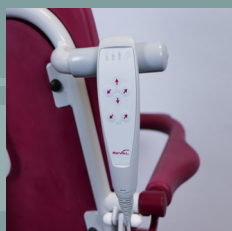
IPX6 hand control