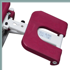
Foot-rest / leg-support.