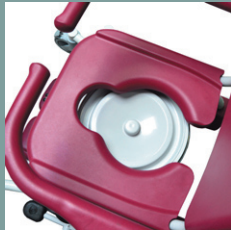
Moulded aperture seat