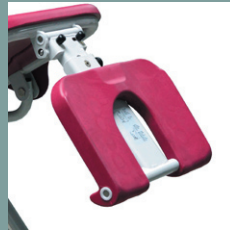
Foot-rest / leg-support