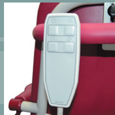
IPX6 hand control