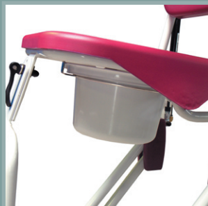
Commode pan option with guide rail.