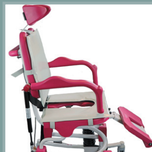
Seat and back cushion.