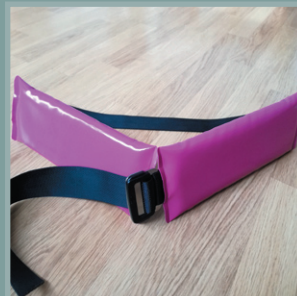
Set of 2 waterproof protections for abdominal sling.