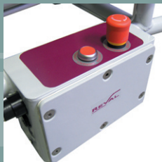
Waterproof electric control