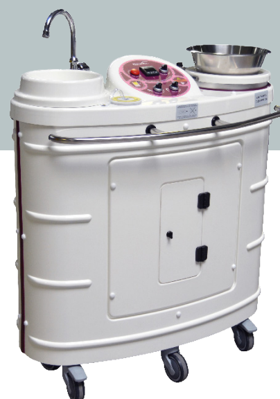
Rubis 3017.00 + "Patient toilet" option réf 3017.60