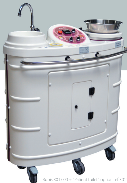
Rubis 3017.00 + "Patient toilet" option réf 3017.60