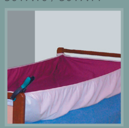
90 x190cm shower sheet for bed 120 x 200cm shower sheet for bed Material: polyurethane & woven fabric.