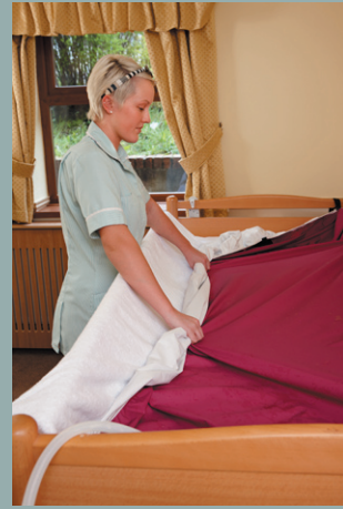
Next, fit the waterproof sheet under the patient. Position the sheet as evenly as possible using the fasteners provided, and fix to side rails and bed ends to ensure water containment.