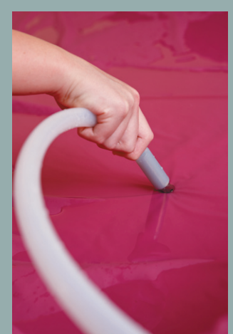
Unclip the shower hose in readiness to use. Then unclip the water vacuum hose and position it at the lowest point of the mattress where water pools fastest. Remove the patient's clothing and check the waters output temperature prior to application.