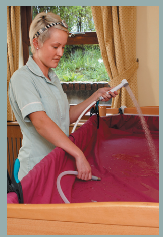
Check the water temperature then proceed to the shower of the patient.