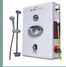
3011.01 Shower system