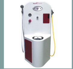
3012.01 Shower & sluice system