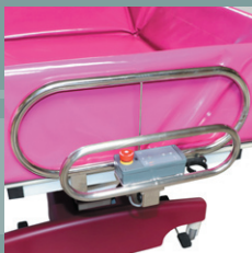
Sensitive push handle