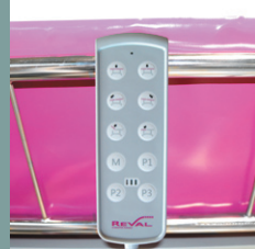
10 functions hand control