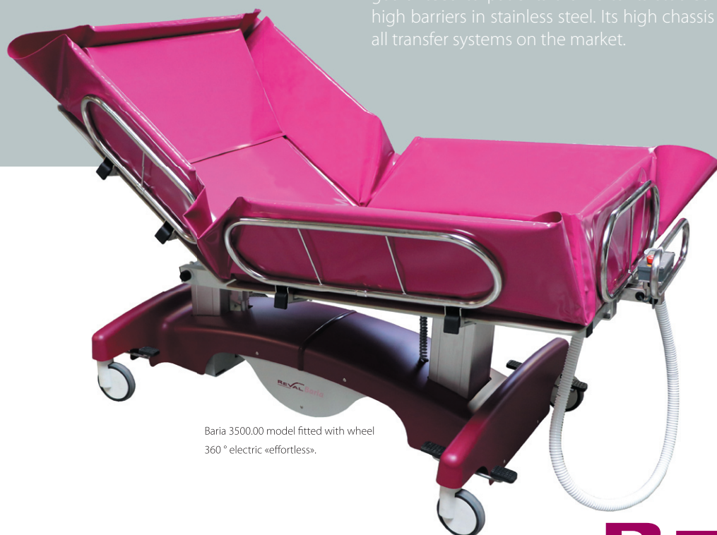
Baria 3500.00 model fitted with wheel 360° electric «effortless».