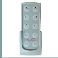
Wireless remote control option