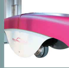
360° electric wheel option