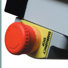
Emergency stop device