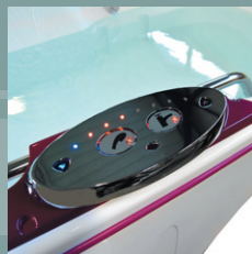
Rada Sense mixer