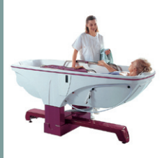
7600.30 «Frame foot» option